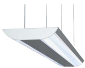
Other format options available upon request